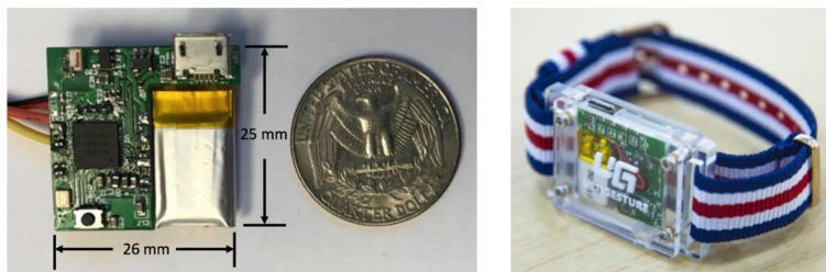
Figure 2: UG Sensor: A combination of accelerometer, gyroscope, magnetometer

FoG with motion sensors. Even though slight signal patterns may occur, it is not enough to lead to prediction. Therefore, researchers divert their attention to mental conditions, which may be essential in the treatment of FoG.[14]. Under this hypothesis, the physiological data such as Electroencephalogram (EEG), Electrocardiography (ECG), Heart Rate (HR), Skin Conductance (SC) are introduced to capture specific features before FoG. Even though most of the physiological data needs to be collected from obtrusive clinical sensors, some data, like HR, can be acquired by a wearable device such as a smartwatch or a smart wristband. Therefore, physiological data also has the potential to predict the FoG episodes unobtrusively. Table 2 show previous work with different sensors. Next, we introduce the sensor selection in more details.